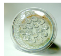
LED Light Bulb