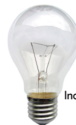
Incandescent Light Bulb